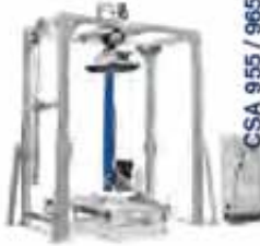
CSA 955 / 965