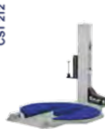
CST - TP Version