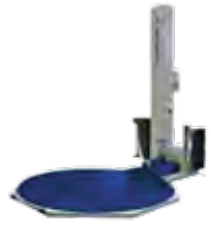
CST 212 Auto Advance