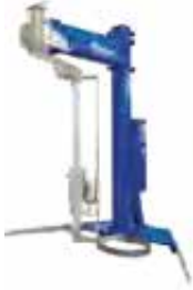
CSA 211 / 212 advance