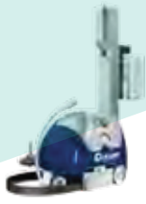
CSM 211 / 212 / 212 Advance