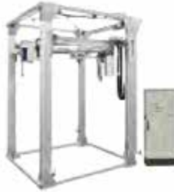
GL 2000 / GL 2000 twin